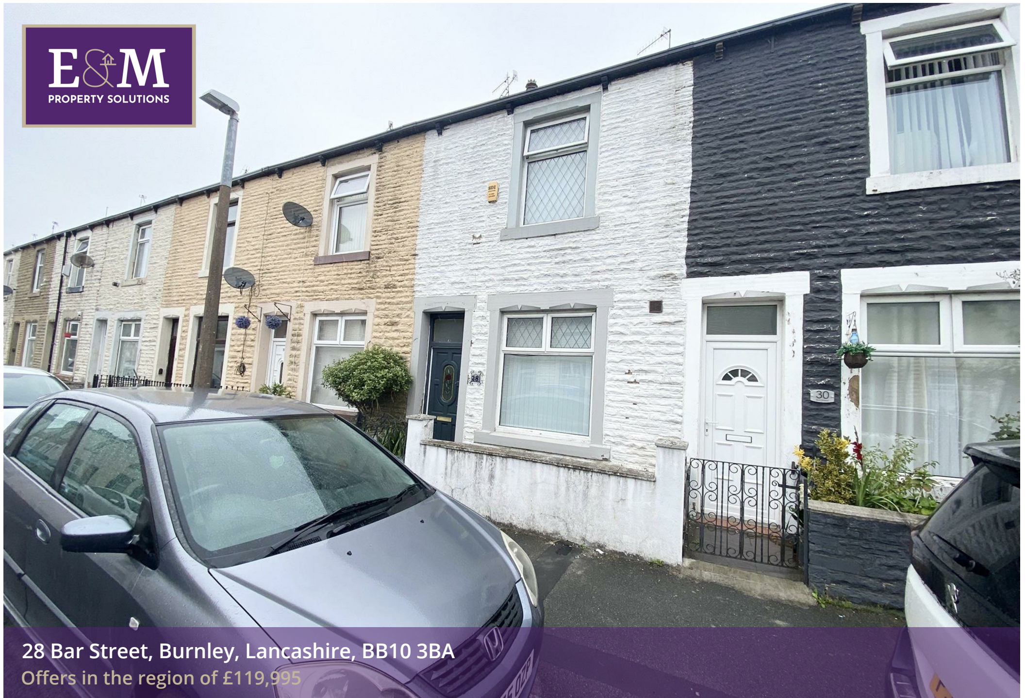
28 Bar Street, Burnley, Lancashire, BB10 3BA Offers in the region of £119,995